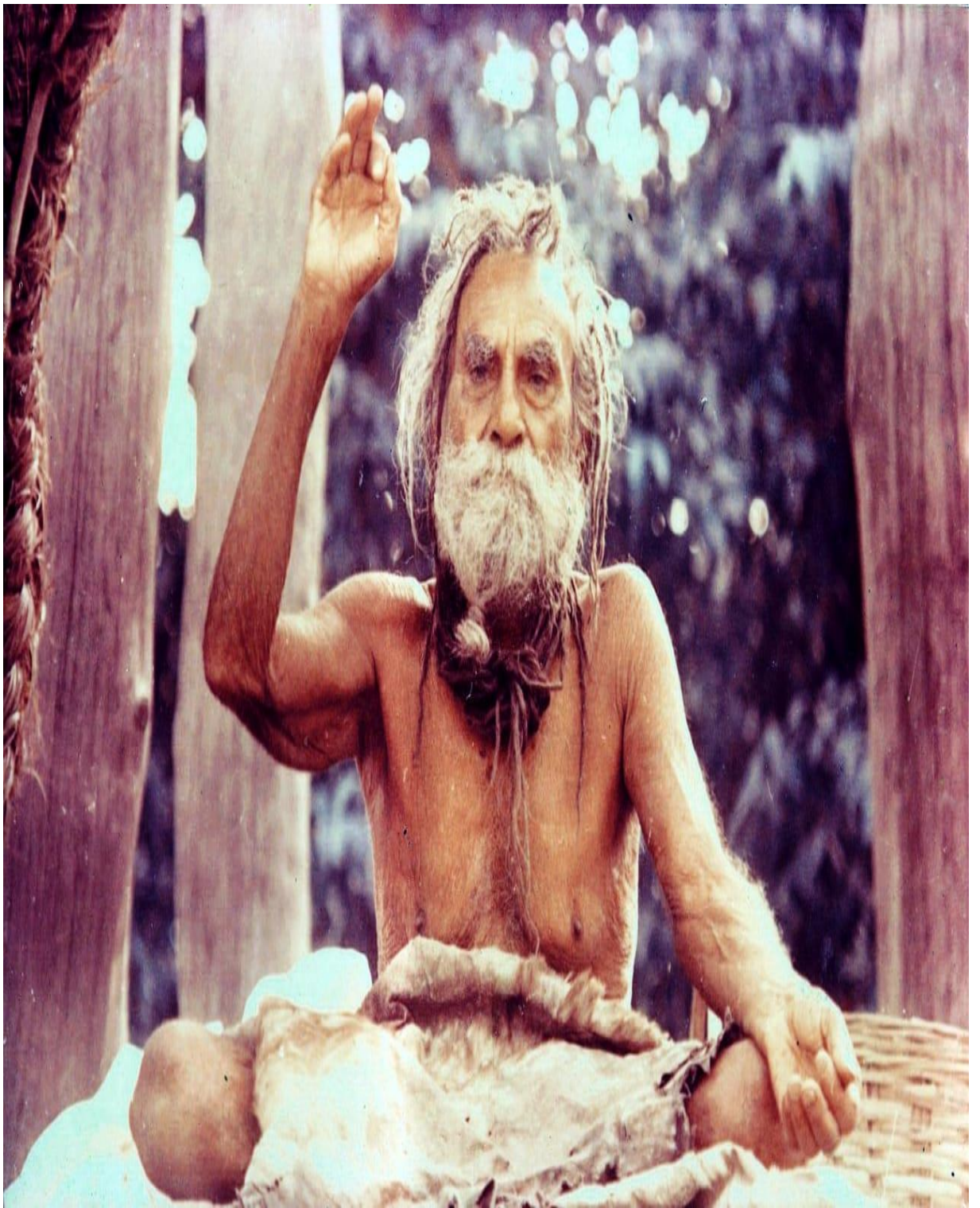
Brahamrishi Shri Devraha Babaji - The Ageless Mahayogi