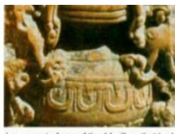
Lower part of one of the 14 pillars that had been affixed to the pier of the Babri Masjid