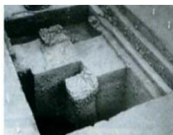
BURIED MYSTERY: Pillar bases unearthed south of the Babri Masjid compound wall